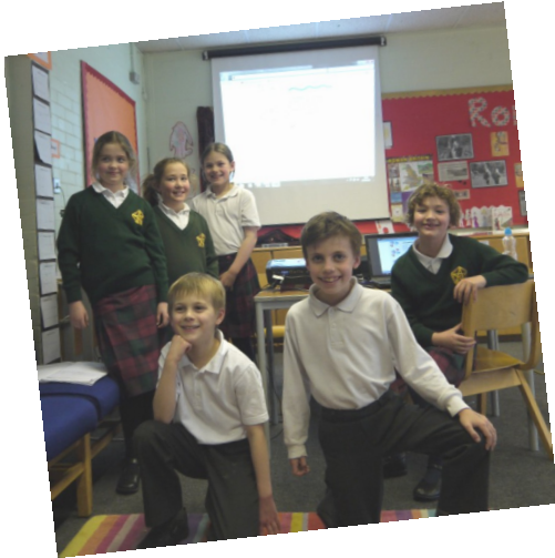
Junior Department with their new projector